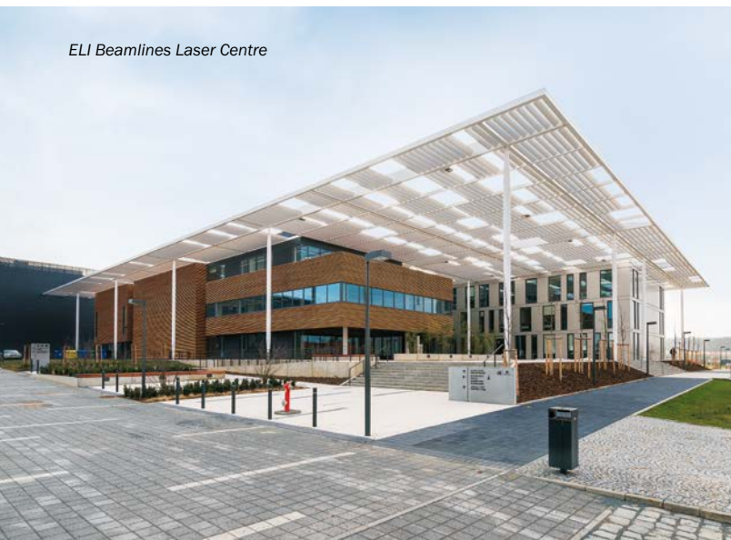
ELI Beamlines Laser Centre