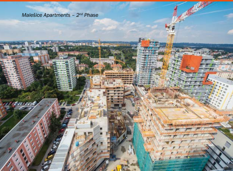
Malešice Apartments – 2 nd Phase

Our company combines the strength of an international group with the knowledge of a local building contractor, capable of handling even the most challenging projects.