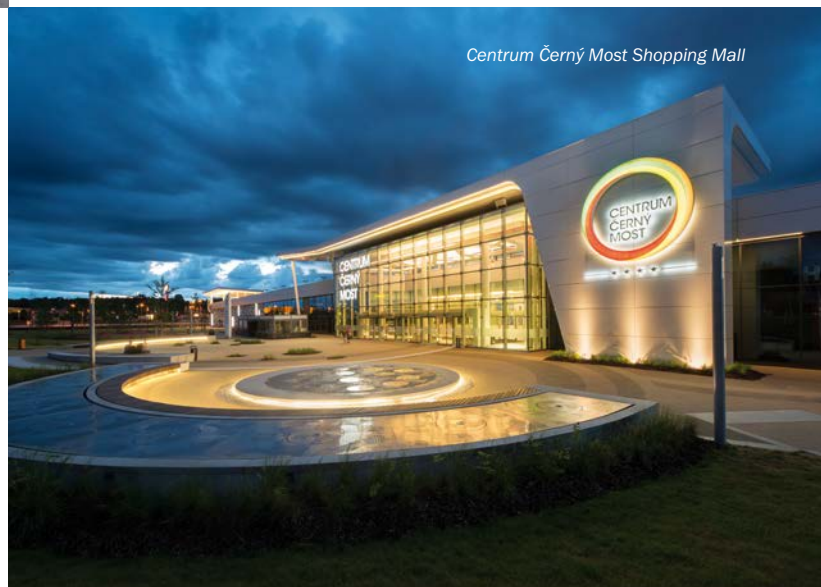
Centrum Černý Most Shopping Mall

Centrum Černý Most: 208,000 m 2 of floor area